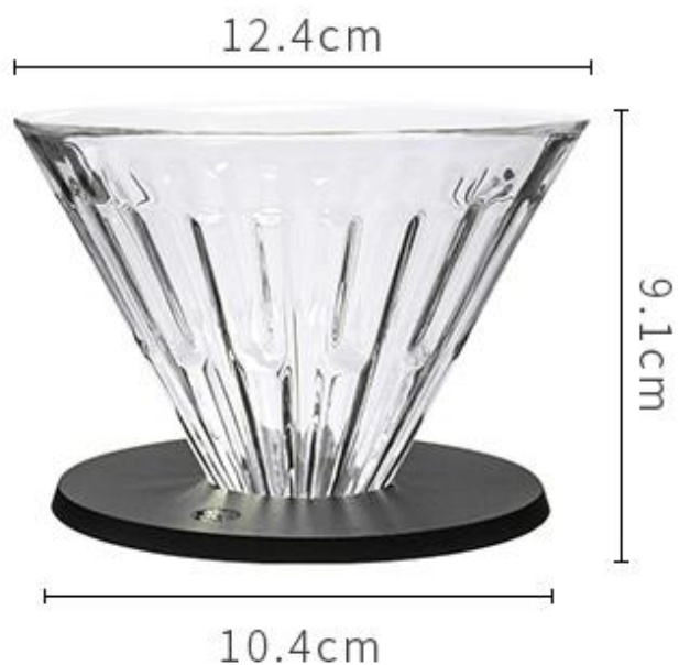
Size 02 for 2-4 cups