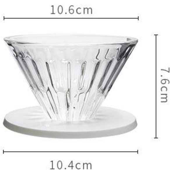
Size 01 for 1-2 cups